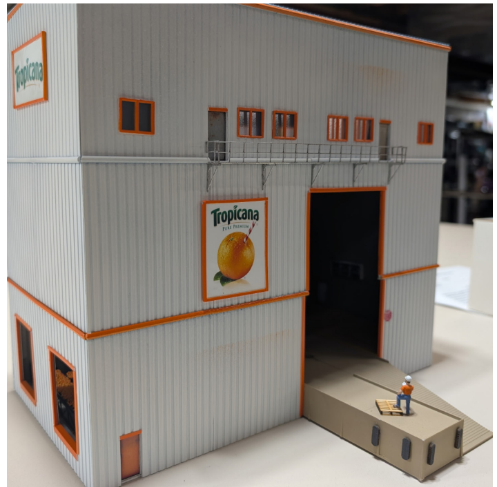
(top) A view of workers sorting oranges on Sam Eisele's possible HO T-TRAK module. (above) The main building for Sam's module idea takes shape.