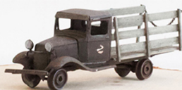
2nd Place - Kit-Bashed Matt Woods