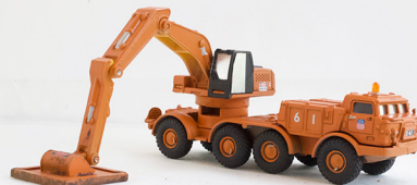
1st Place - Scratch Built Sam Eisele