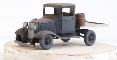
1st Place - Craftsman Kit Matt Woods