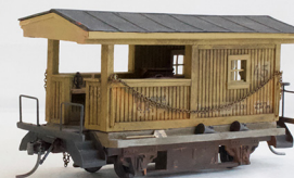
2nd Place (tie) - Scratch Built Steve Zapytowski