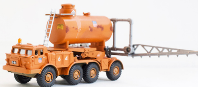
1st Place (tie) - Kit-Bashed Sam Eisele