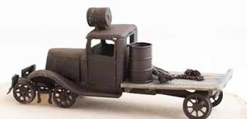
2nd Place (tie) - Scratch Built Matt Woods