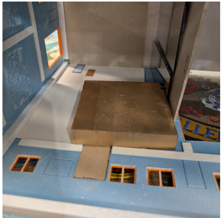
(top) Sam's “incoming/sorting building” begins to take shape. (above) Blocks of wood are just one technique Sam used to rein in the unruly building panels.