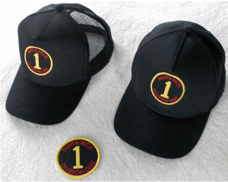
HATS & PATCH