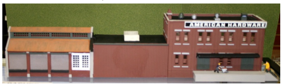
2<sup>nd</sup> Place - Mike Bradley