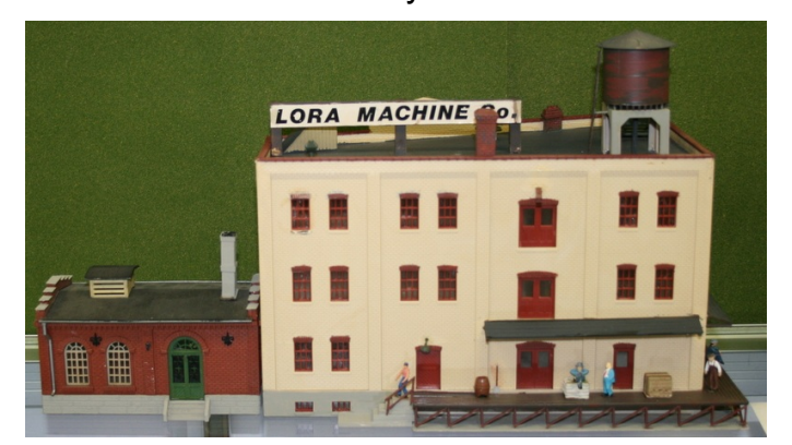
1<sup>st</sup> Place - Mike Bradley