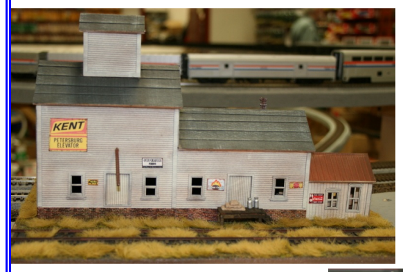
2<sup>nd</sup> Place Don Bonk