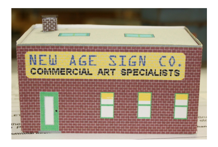
2<sup>nd</sup> Place - Ray Lora