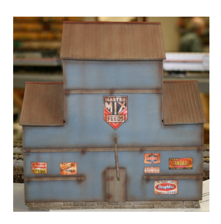
1st Place - Matt Woods