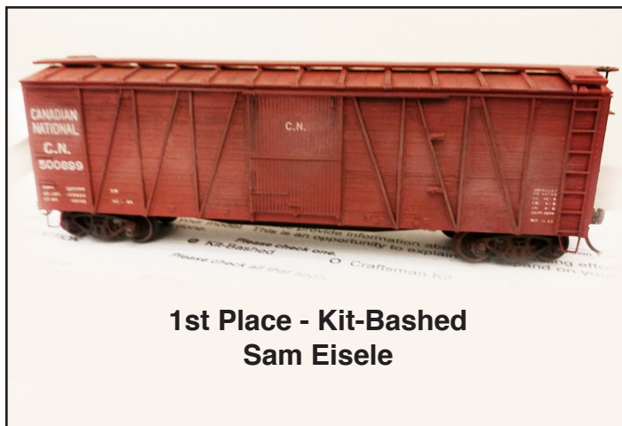
1st Place - Kit-Bashed Sam Eisele